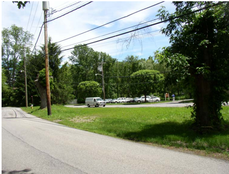
Subject Site looking Northeast from Old Mount Kisco Road