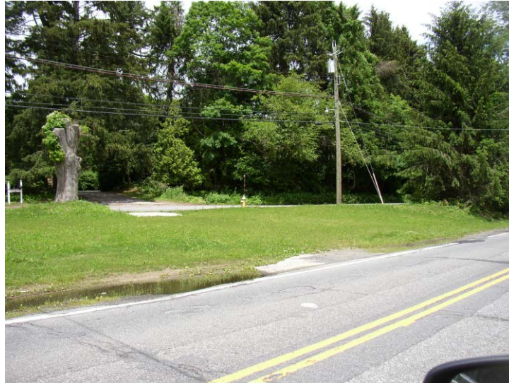
Subject Site looking North from Main Street