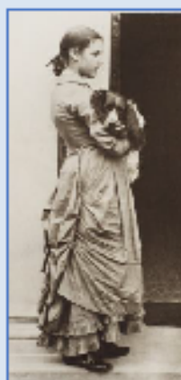
Beatrix Potter, aged 15, with her dog Spot, circa 1880.

We'll journey to the Morgan Library & Museum on 36 th St. in NYC and start our day with a lovely Afternoon Tea which includes Tea Sandwiches, Scones, Sweets, Preserves, Clotted Cream, Harney & Sons Tea.