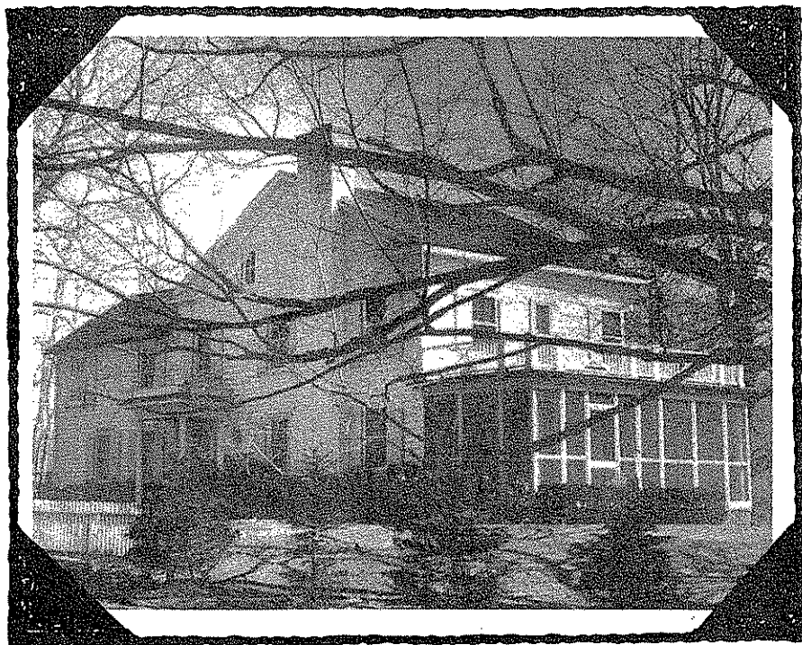
Historic Dayton house (shown in pre-fire photo) saved from fire.