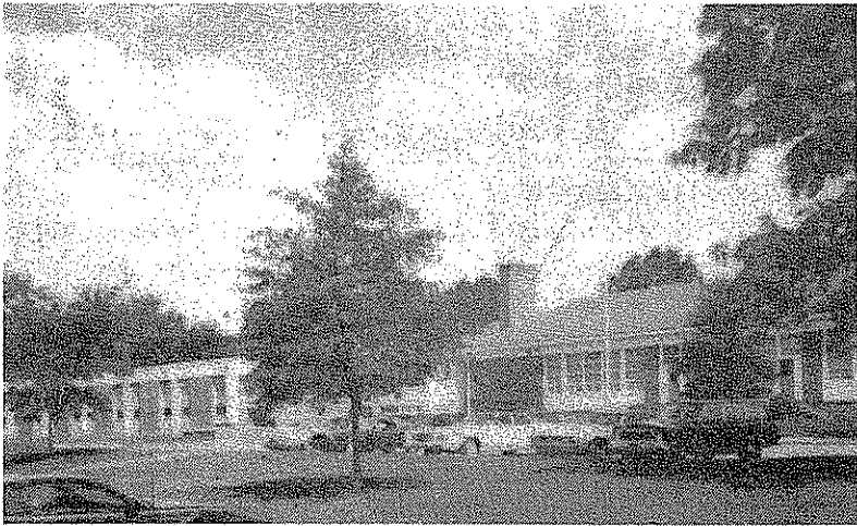
OVERGROWN FOLIAGE and boarded windows today shut in decades of memories at unused Whippoorwill School, while Wampus School continues service to students of Byram Hills District.